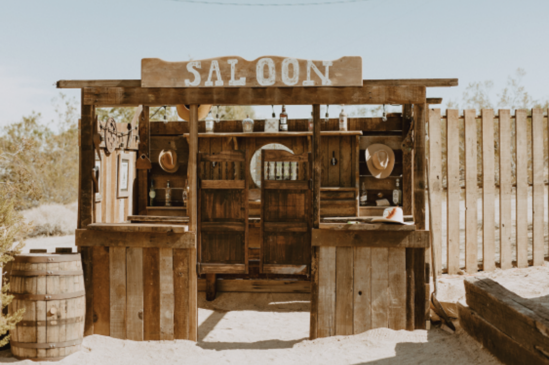
Saloon is built of reclaimed wood // 10 x 12 foot print