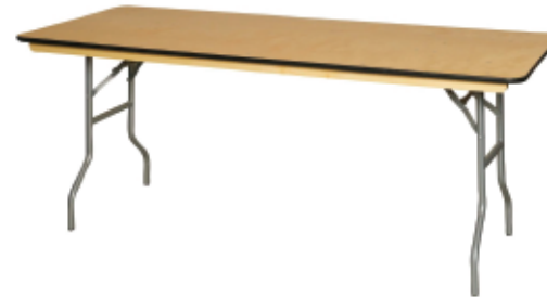
6' Wooden Table QNTY: 2 $25/ ea