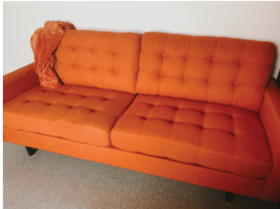
Orange Couch QNTY: 1 $50