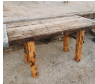
Reclaimed Sweetheart Table QNTY: 1 $30