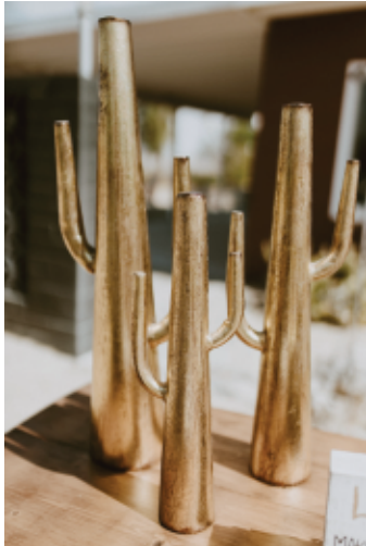
Gold Cactus Accents Various Sizes QNTY: 3 $10