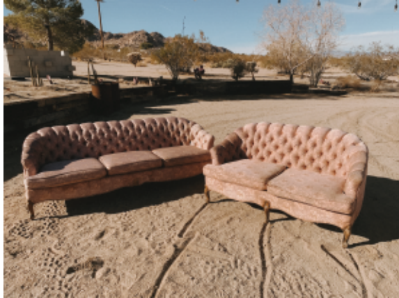
Vintage Blush Couches QNTY: 2 $50