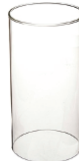
8" Glass Hurricane QNTY: 40 $2/ ea