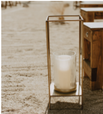
Gold Candle Accents Various Sizes QNTY: 6 $20