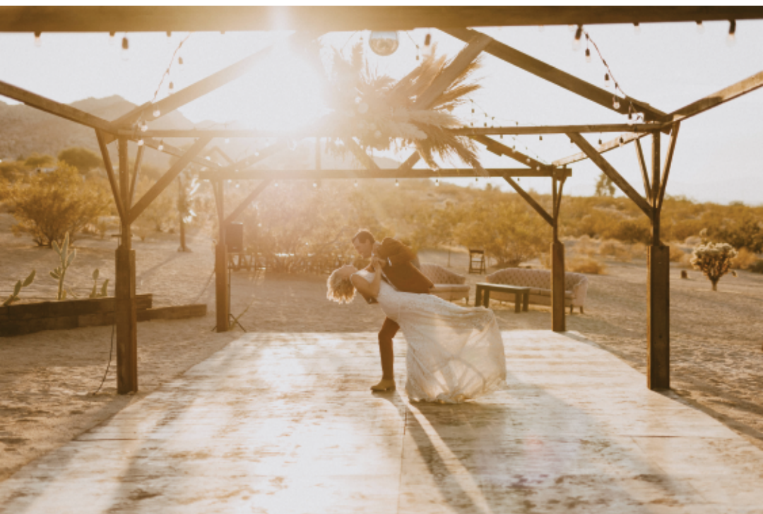
Exposed wooden barn built of reclaimed wood // 18 x 40 foot print