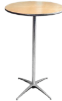
12" Belly Bars QNTY: 2 $15/ ea