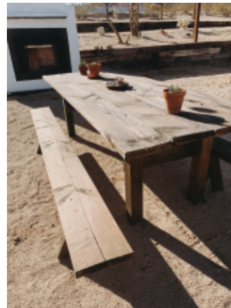
8ft Farm Table w/ Benches QNTY: 1 $75