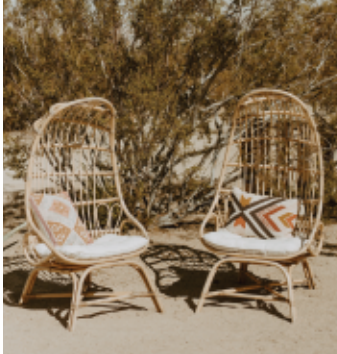
Boho-Rattan Chairs QNTY: 2 $75