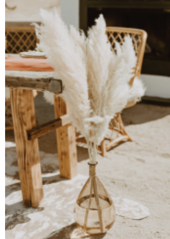
Large Vases QNTY: 2 $25